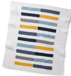
Baby Boy Version