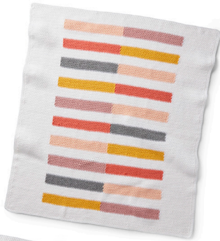
Baby Girl Version